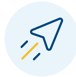
INNOVATION & TECHNOLOGY