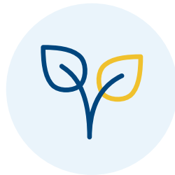
CORPORATE SUSTAINABILITY & ENVIRONMENT