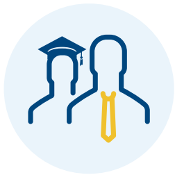
WORKFORCE & EDUCATION