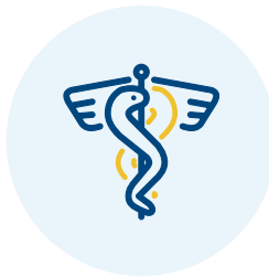
HEALTH CARE & LIFE SCIENCES