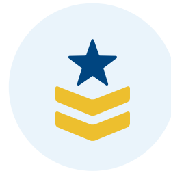
MILITARY & VETERANS AFFAIRS