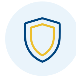
SAFETY, PREPAREDNESS & RESILIENCY